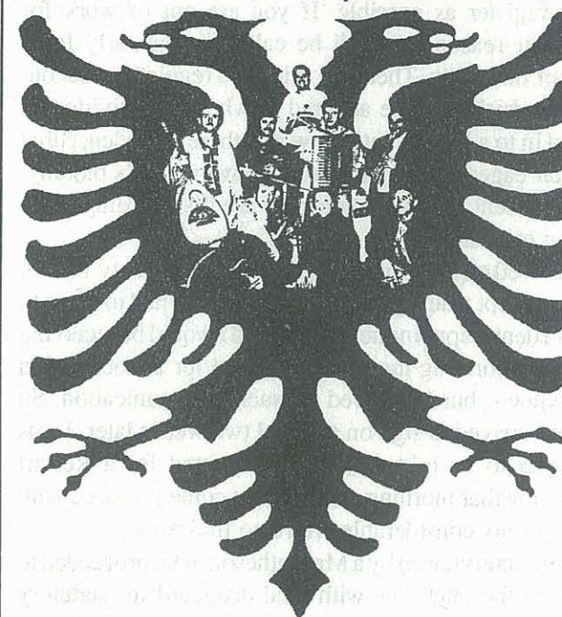
Albania comes to Broughton – see page 3.