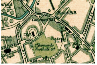
Bartholomew Survey Atlas of Scotland (1912)

Archaeology Scotland – the national heritage education charity – is planning a geophysical survey, excavation, site interpretation, and on-site recording at the former St Bernard's Football Club ground in and adjacent to King George V Park. Two trenches will be dug close to the path leading down from Royal Crescent. The programme aims to develop team working, language and maths skills, technology management, independent