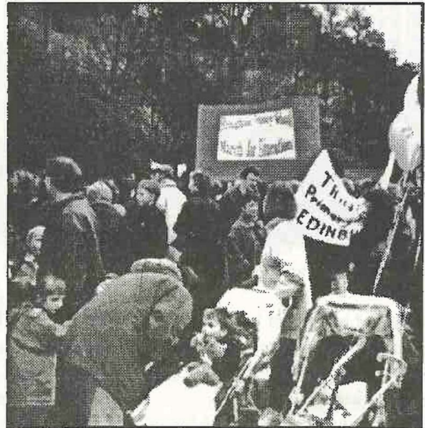
'March for Education' - Broughton Primary's banner