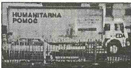
Convoy truck at Beaverbank base

There will be jazz and folk music, and a bar. If you're interested, phone Andy on 557 8113.