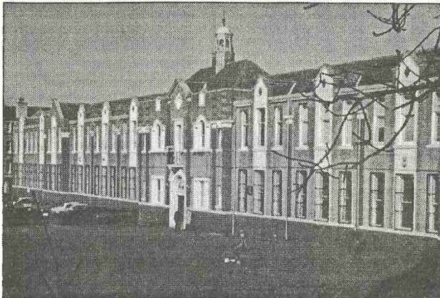
Proposed site of Saturday Market

We reported in our last issue plans to use Drummond playground for a Saturday market between 7am and 6pm throughout the year.