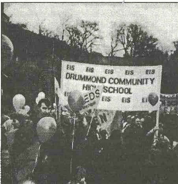
Marchers assemble at Waterloo Place

The size of the march showed just how strong the feeling against this attack on our children's education is. But to force the Government to have second thoughts the pressure must continue. If you haven't already done so, write to your MP, Malcolm Chisholm - 274 Leith Walk, EH6 5EL. And to Michael Forsyth MP, Secretary of State for Scotland, St Andrews House, EH1 1DG.