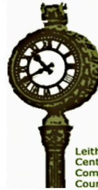
Leith Central Community Council

A forum for local people who want to engage with and work for their local community.