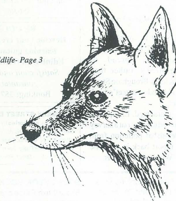
Bellevue wildlife- Page 3