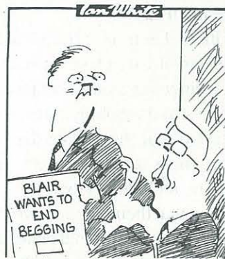
Go on, guv - give us your vote ...