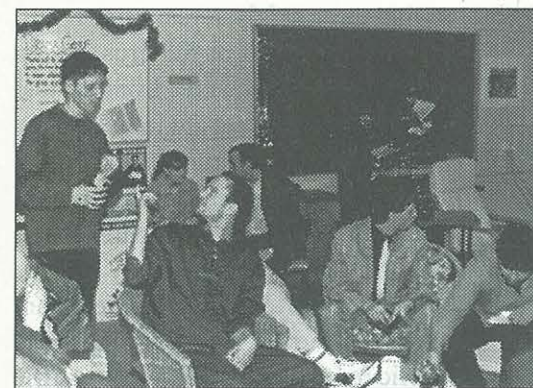
Christmas party at the Stafford Centre

that mental health community services have always been under-resourced. To contemplate further cuts on top of the no-increase policy of last year will have a serious detrimental effect on service users, their families - and ultimately on the community.