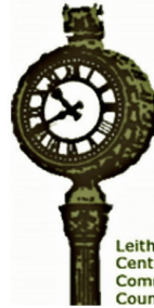
Leith Central Community Council

Are you interested in representing locals' views to City of Edinburgh Council, other public bodies and private agencies in this area?